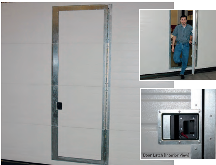
Door Latch (Interior View)

Available for Model 2700 only in door sizes up to 16'2" wide x 16' tall. Wind Load option not available.