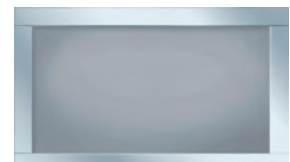
OPTIONAL FULL-VIEW PANEL Clear and Dark Bronze Anodized Aluminum, White Powder Coat, or Custom Powder Coat colors. Not available for 1350.