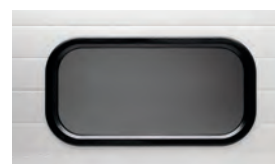
26" x 13" DOUBLE INSULATED ACRYLIC WINDOWS WITH BLACK FRAME