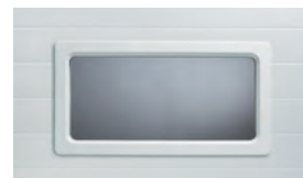
24" x 12" INSULATED GLASS Available with either a black or white frame.