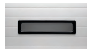
24" x 6" DOUBLE INSULATED ACRYLIC WINDOWS WITH BLACK FRAME